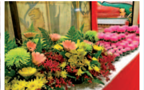
Lotus candles and flower bouquet will be available for sponsorship.