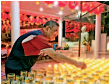
Oil Lamps will be available for sponsorship.