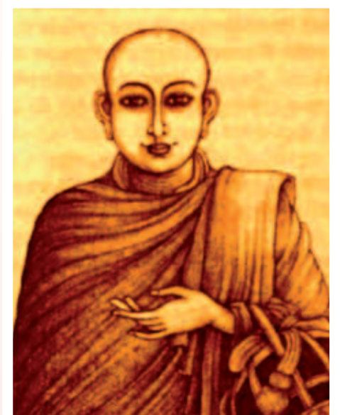
Bhikkhuni Khema was the first chief female disciple of the Buddha.

For example, key concepts in Buddhism, including the inherent emptiness of the self, may be read as radical rejections of static ideas of gender and the championing of stereotypically feminine characteristics. Compassion in Buddhist traditions demonstrate the potential for women as well as men to attain the highest goals of the tradition. The vastness of Buddhist literary traditions, as well as its sheer diversity across time and space, leaves it open to multiple interpretations, and similarly, the role of women in the tradition and their potential as leaders also remains open to discussion and debate.