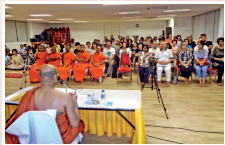
An attentive dhamma audience but who is really listening with a clear mind.