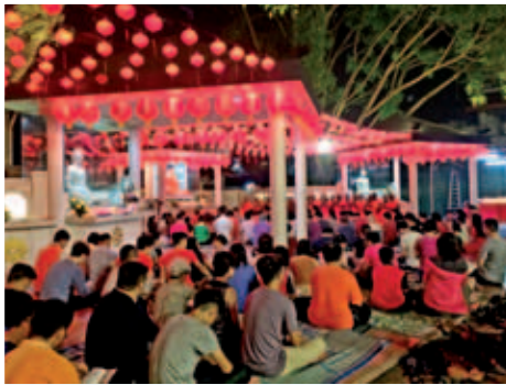
CNY Eve Blessing Service.

There will be blessings conducted by the Maha Sangha at 11pm. Oil lamps can be sponsored for peace and prosperity. Lotus candles, flower bouquets and Chinese lanterns are also available for sponsorship. Refreshments will be served after the puja.