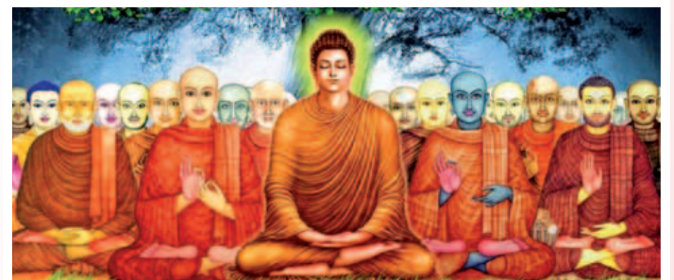
Buddha and his Disciples

One day, a seller of 'tippili' or long pepper ran into serious trouble. Knowing not who Venerable Pilindavaccha was, he was taking a wagon load of 'tippili' for sale, having a sample of specimen 'tippili' in a basket.