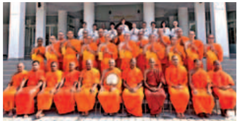
Group Photo of the 18 Novice monks and 9 Upasikas with the Maha Sangha.