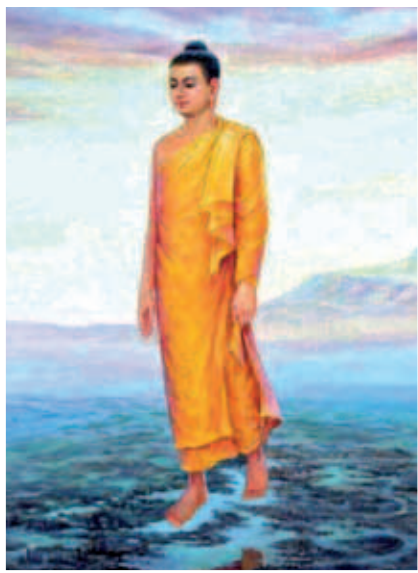
Gautama Buddha was tall and pleasing to the eye.