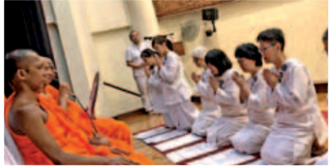
Upasikas taking their precepts.