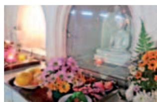
A tray of offerings to the 28 Buddhas.