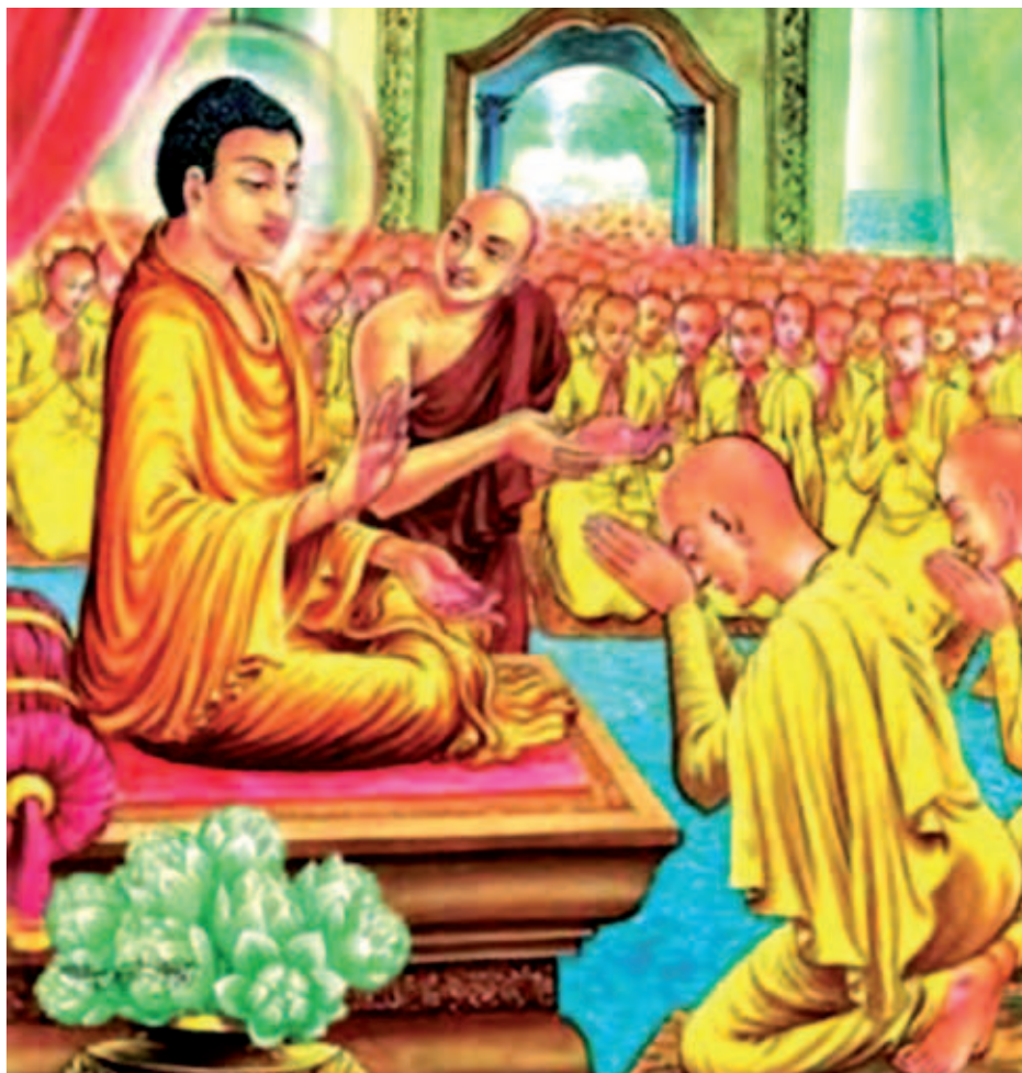
Maha Prajapati Gotami seeking ordination from the Buddha.

Other historical narratives can be interpreted as similarly disparaging toward women. According to tradition, the Buddha refused his stepmother Mahaprajapati's request for women to be able to become ordained and participate in the Sangha, the Buddhist community, three times before he finally acquiesced, but only after she promised that ordained women would follow extra rules. Today several major monastic lineages in Sri Lanka, parts of Southeast Asia, and Tibetan cultural areas deny female renunciants full ordination, stating that the lineage of nuns was broken long ago and without the Buddha's authority cannot be restarted.