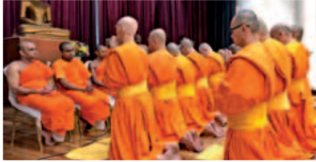
Ordination Ceremony on 8 th December.