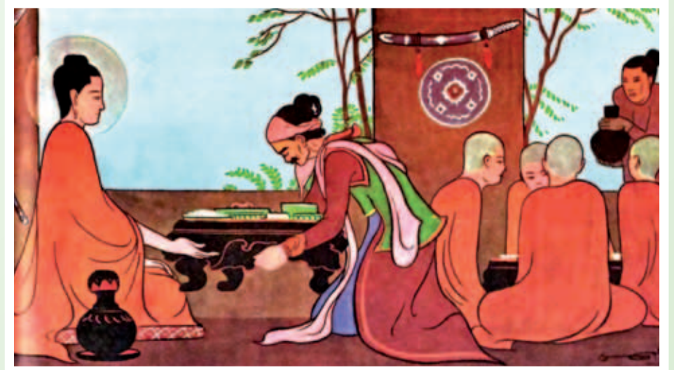
The Buddha partaking in a mid day meal.