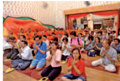
CNY New Moon Puja.

There will be blessings by the Maha Sangha throughout the day. Free vegetarian lunch will be served after the Dana at 12 noon. New Moon evening puja will commence at 7.30pm with offerings followed by Sutta chanting and a dhamma talk.