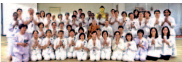
Group Photo to commemorate the Observance of 8 Precepts.