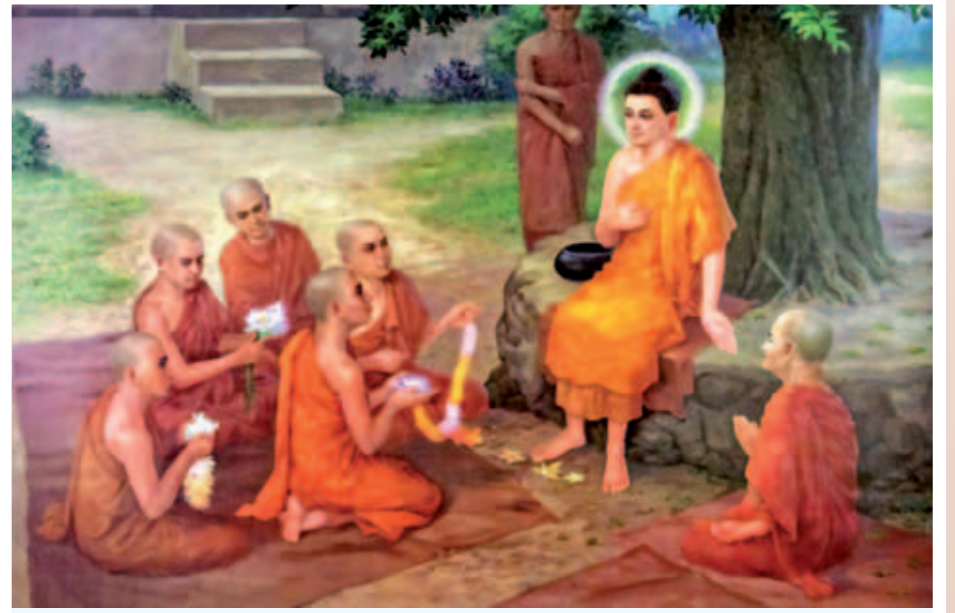
Not everyone was paying attention to the Buddha during a dhamma sermon.

Listening to Dhamma is difficult not only because of the appearance of the Buddhas in the world is difficult but also those who listen do not have proper attitude to listening. It is very difficult to focus the mind on the Dhamma teaching. One needs to be highly motivated to listen to Dhamma with undivided mind.