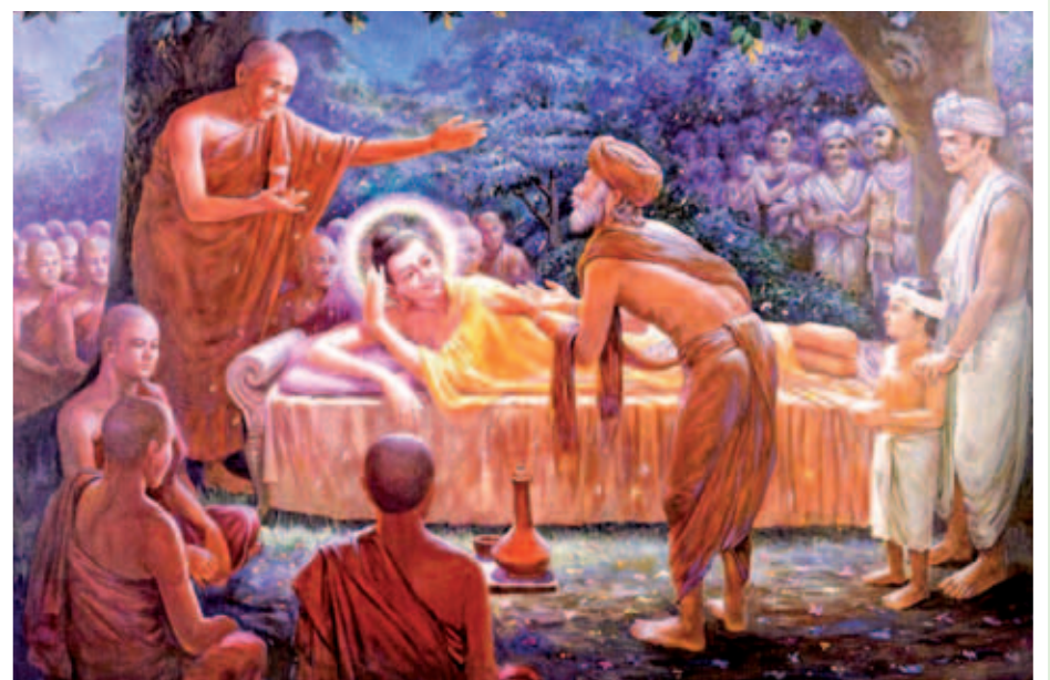
The Buddha had many guests and he made himself available to anyone who needed him.