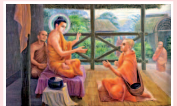
Buddha speaking to Ven Pilindavacca regarding his offensive language.

He was asked to meet the Maha Arahant again in the same way, to be careful to reply simply that they were 'tippili'. Then the Venerable Pilindavaccha would say "Be it so". Then you would discover the true nature of your goods. The trader did so and was glad to retrieve his fortune, for instantly the goods of the trader were in the original state by the same process.